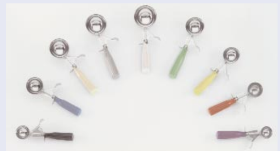
D. COLOR-CODED DISHERS / SCOOPS