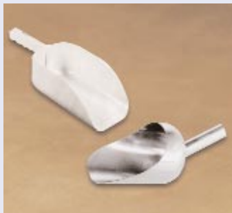
F-G. UTILITY SCOOPS