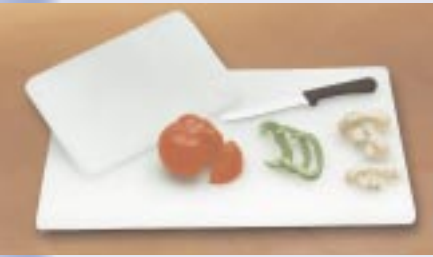
I. PLASTIC CUTTING BOARDS