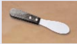
K. SANDWICH SPREADER