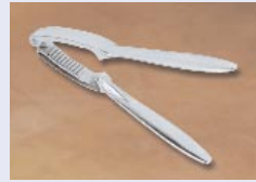
Q. LOBSTER CRACKER