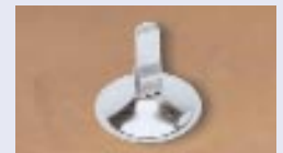
W. MENU HOLDER