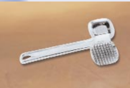
J. MEAT TENDERIZER