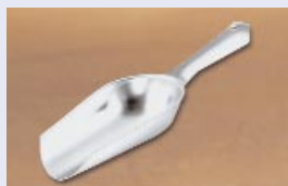
O. ICE SCOOP