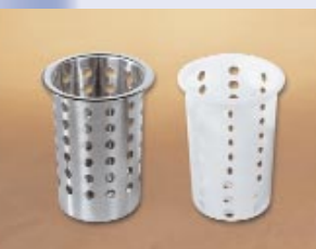
P. SILVERWARE CYLINDERS