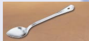
B. 21" SOLID SPOON