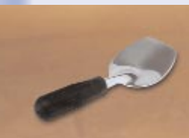
N. KITCHEN SPADE