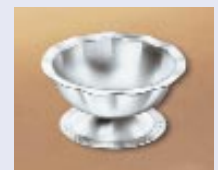
V. SHERBET DISH