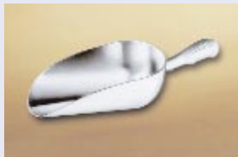
H. ALUMINUM SCOOP