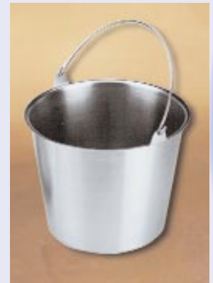
S. UTILITY PAIL