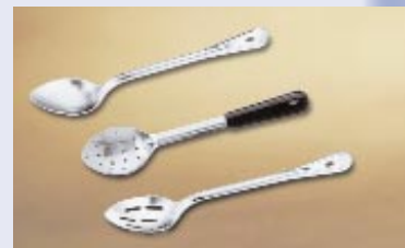
A. KITCHEN SPOONS