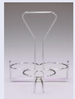
X. THREE RING SYRUP HOLDER