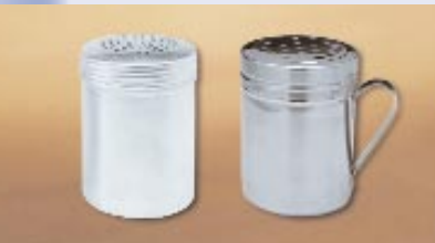
L-M. SHAKER/DREDGER ALUMINUM OR STAINLESS STEEL