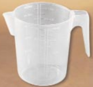
B. GRADUATED PLASTIC MEASURE