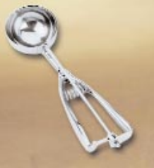
E. FOOD BALLER