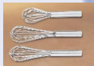
F. HEAVY DUTY SEALED WHIPS