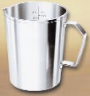
A. GRADUATED STAINLESS STEEL MEASURE