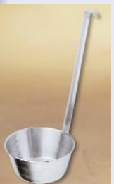
C. GRADUATED DIPPER