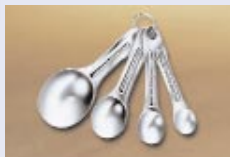
D. MEASURING SPOON SET