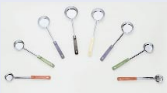
C. COLOR-CODED ONE-PIECE LOONS