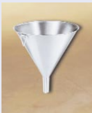
E. UTILITY FUNNEL